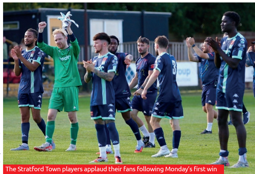
The Stratford Town players applaud their fans following Monday's first win