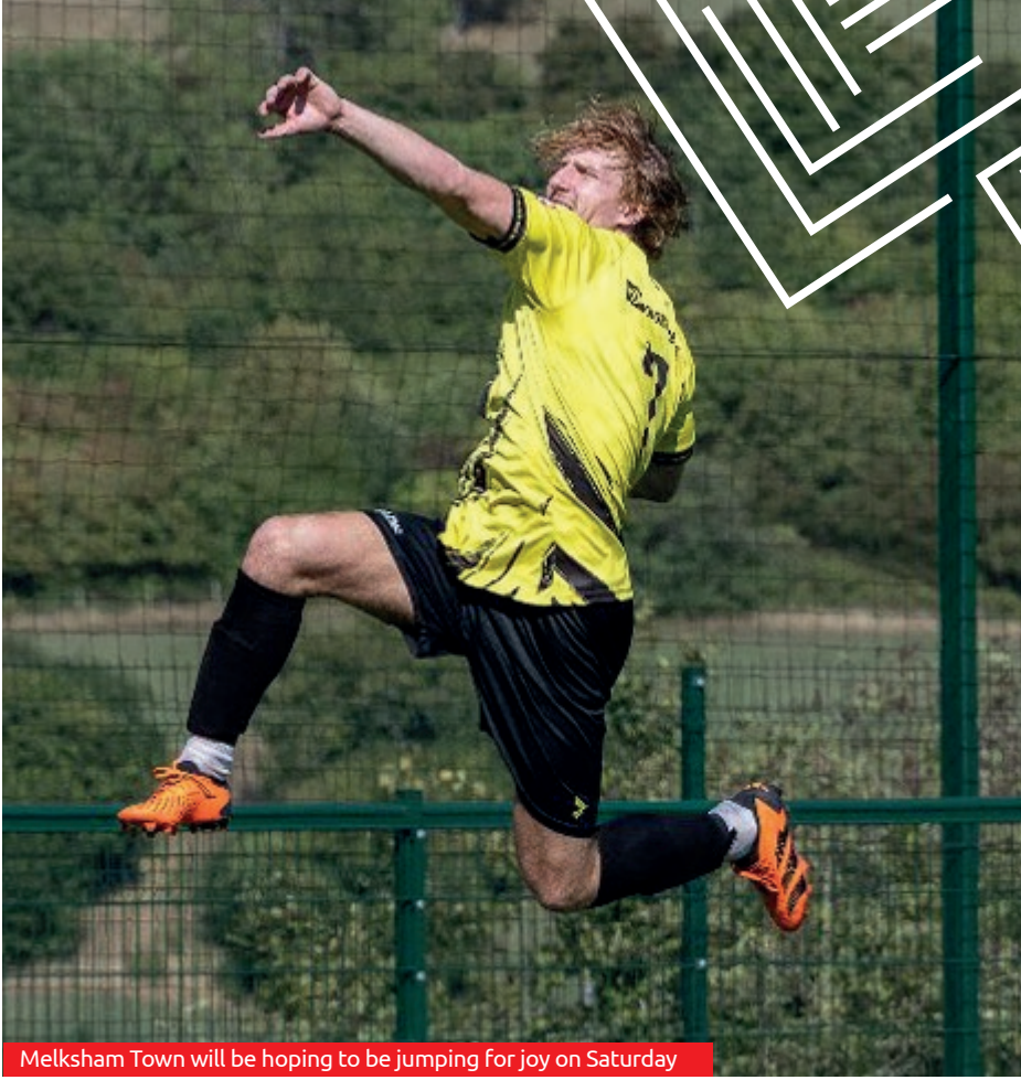
Melksham Town will be hoping to be jumping for joy on Saturday

Two of our clubs go head-to-head at Falmouth Town as the Cornish outfit welcome a resurgent Brixham AFC. There's an away trip for Frome Town as they head down to Plymouth Parkway,