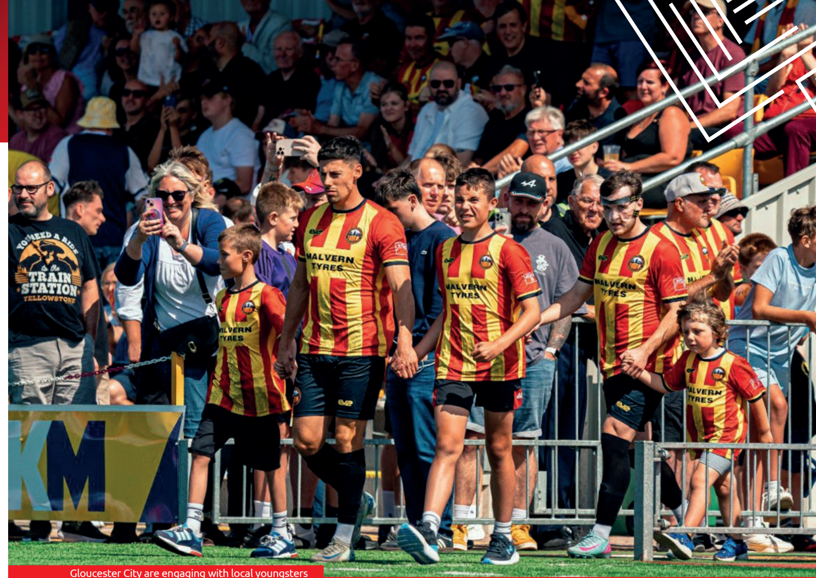
Gloucester City are engaging with local youngsters